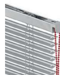
Lateral chain drive * Control and tilting of slats via chain drive, lateral chain exit