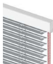
Lateral chain drive * Model ISOLINE (with cover plate) Control and tilting of slats via chain drive, lateral chain exit