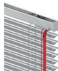
Pull cord * Tilting of the slats via tilt control rod