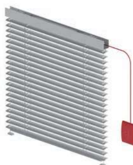
Motor drive Electric driven